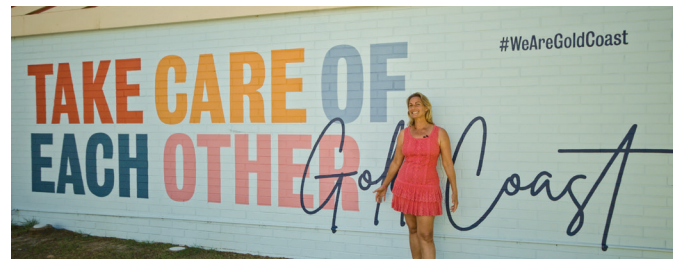
Essentially Cooly tourism ad campaign

Local Coolangatta and Kirra businesses doing it tough due to the current border restrictions are banding together, and local identities are lending their voices to encourage other Gold Coasters and Queenslanders to visit Coolangatta to show their support. The local community funded its own tourism ad campaign emphasising what's really important – looking after each other.