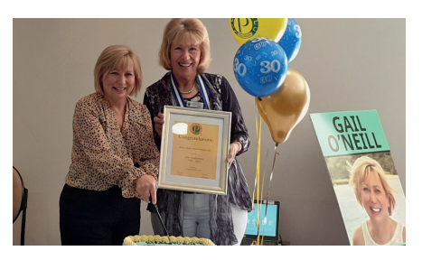
Probus Club of Kirra-Tugun's 30th Birthday

I was happy to be invited to present a certificate to Probus Club of Kirra-Tugun as part of their 30th birthday commemorative celebrations. This great bunch of people like to keep informed and regularly meet to lift each other's spirits during these uncertain times.