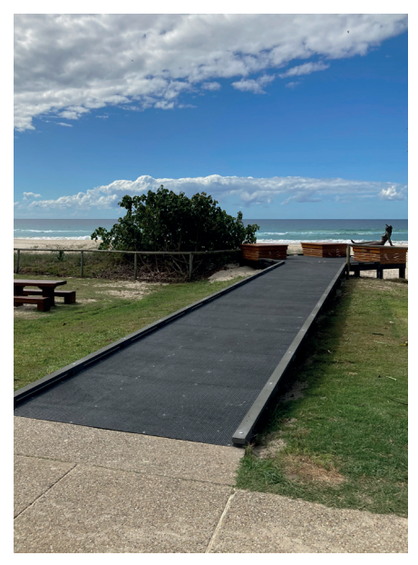
Viewing platform, Currumbin

Works to replace the decking boards at the beachfront viewing platform at Currumbin Beach are complete. Maintenance works were also completed on the 'Sun Spirit' sculpture which has been reinstated.