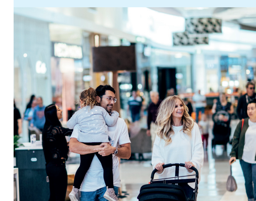
TOM TATE - MAYOR