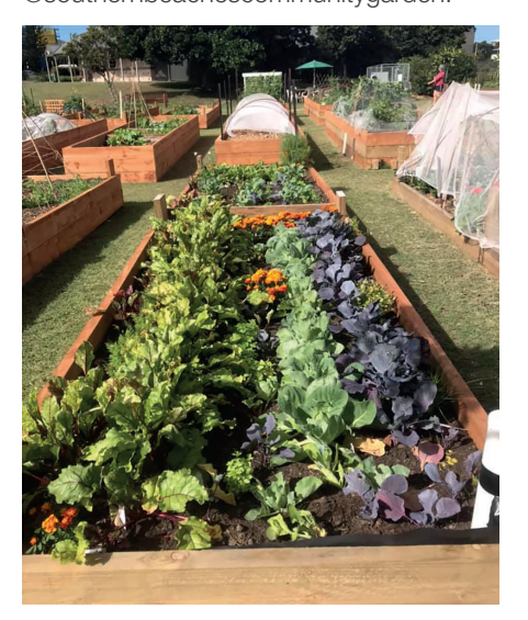
Southern Beaches Community Garden

The dedicated, volunteer green thumbs at Southern Beaches Community Garden have been busy expanding their plot space and building new garden beds ready for Spring. Find out more by visiting: southernbeachescommunitygarden.com/ or follow them on Facebook @southernbeachescommunitygarden.